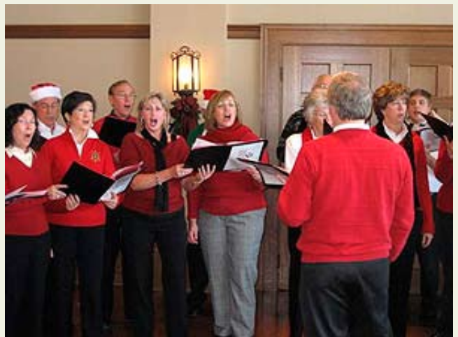
We were entertained by the Edina Chorale at our December meeting.