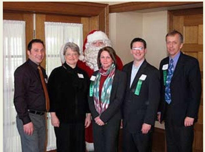
Our December new members and our special guest, Santa Claus.