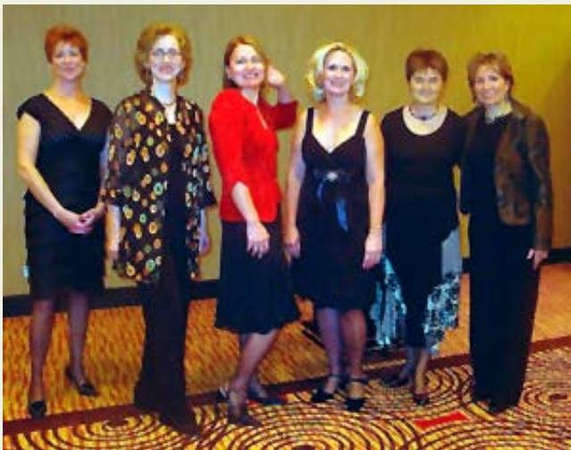
Thank you to all of our models who volunteered for our 4th Annual E-Squared Fashion Show in December, all who attended had a great time!