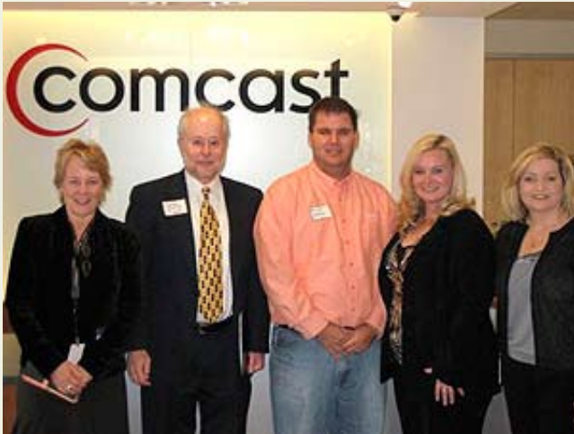
The group from Comcast hosted a great AYBB in December. Thank you!